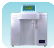
Water purification system