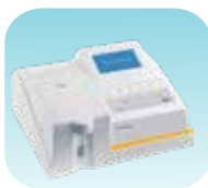
Semi Auto Bio Chemistry Analyzer