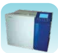
Optima Gas Chromatograph 2979 Plus