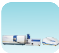
Laser Particle Size Analyzer