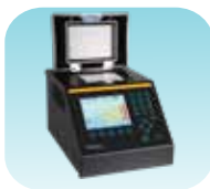
PCR/Gradient PCR/ RTPCR