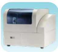
NOVA-2100 Chemistry Analyzer