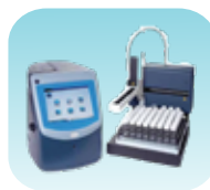
Total Organic Carbon 3800