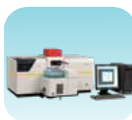
Atomic Absorption Spectrophotometer