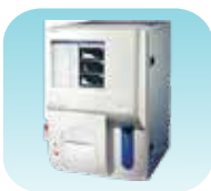
HEMA 2062 Hematology Analyzer