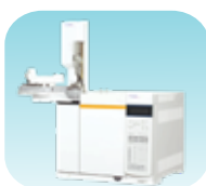
Optima Gas Chromatograph 3007