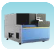
Optical Emission Spectrophotometer