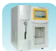
Liquid Partical Counter