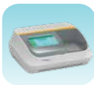
Micro Plate Reader/Washer